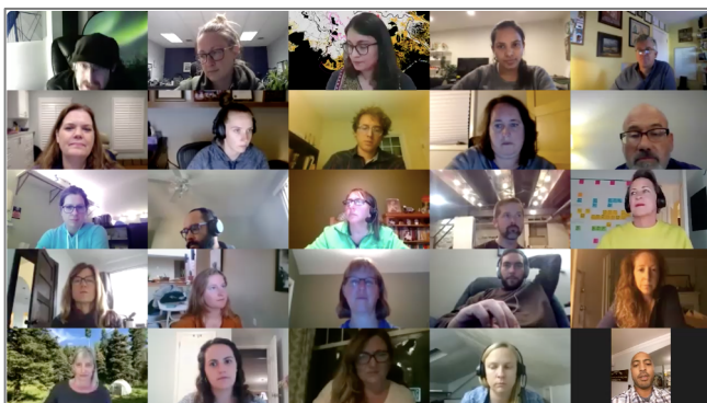
Participants from the Fall 2020 Evening Program